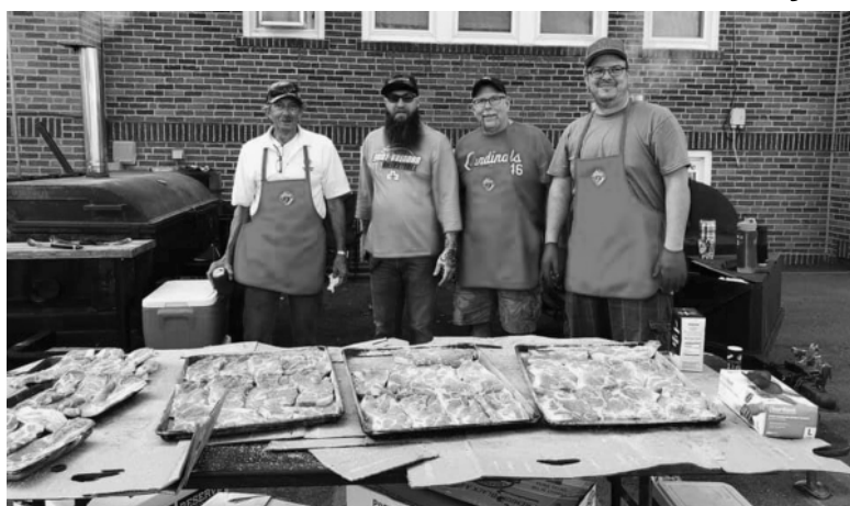
On October 10, 2021 members of Knights of Columbus Council #3760 proudly cooked and served food for the 100 year anniversary celebration of St. Brendan Catholic School in Mexico, Mo. Knights cooked over 272 pork steaks for the noon meal.