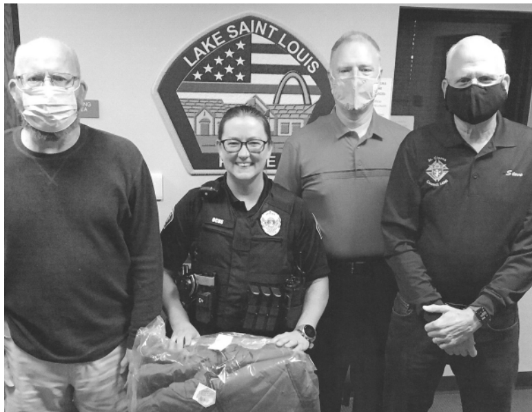
St. Gianna Council 14561 Wentzville continues to show support for their community with a successful 2021 Coats for Kids program.